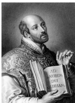
St. Ignatius of Loyola – 16 th c founder of the Jesuits who developed a refined sense of what good discernment looks like amidst difficult choices