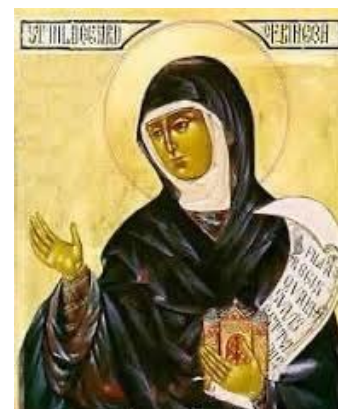
St. Hildegard of Bingen – 12 th c “Sibyll of the Rhine” who remained creative and resilient against every challenge throughout her life, using her many gifts to the full.