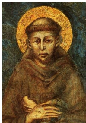
St. Francis Assisi – 12 th c peacemakers who reached across cultures to form relationships, including with the Sultan Malik-al-Kamil