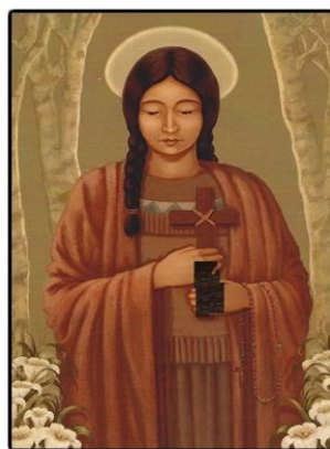
St. Kateri Tekakwiths – 17 th century Mohawk/Algonquin woman who practiced holiness amidst a time of great cultural clash and changing historical tides.