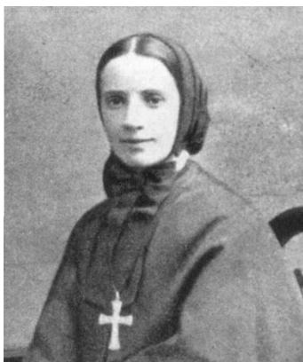
St. Frances Cabrini – champion of the needs of immigrants and refugees; master fundraiser in late 19 th /early 20 th century US