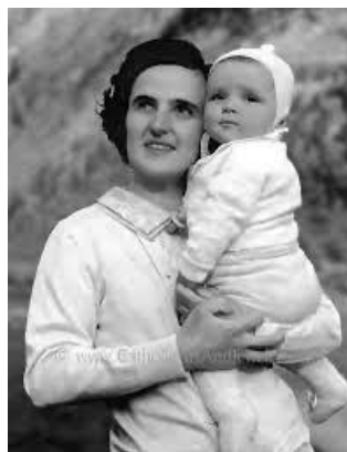
St. Gianna Beretta Molla – physician who endured multiple difficult pregnancies and understood well both the health concerns of women and the dignity of the unborn child.