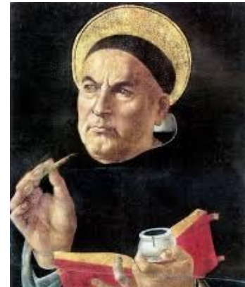
St. Thomas Aquinas – 12 th c theologian who wrote clearly and concisely on truth - both as having a mind aligned with reality and as honesty.