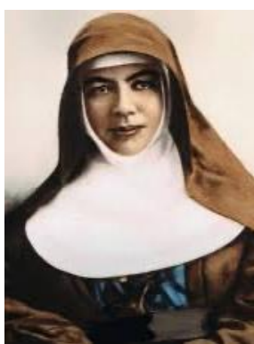
St. Mary McKillop – founder of a community of teachers in Australia who suffered for speaking up against a leader's sexual misconduct.