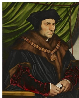
St. Thomas More – chancellor under Henry VIII who stood up to the king's increasingly impulsive rule in 16 th c England. Died rather than perjuring himself on the stand.